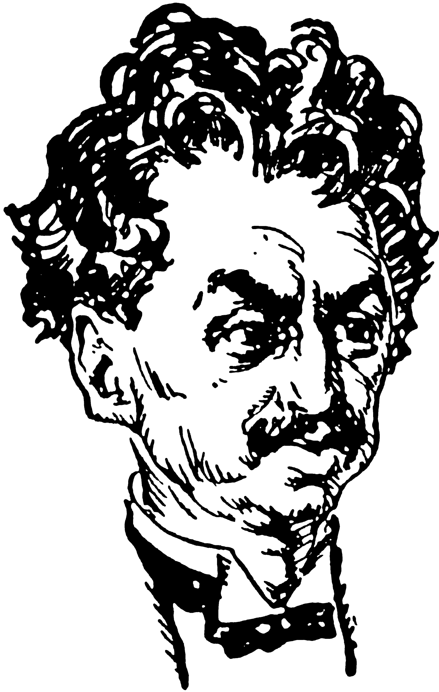
Stainberg (Stony mountain) Commissioner of Justice.

The law seems always fickle, But the Jew cuts its top with a sickle, Tears it out by the root Till his ends it will suit. If thus at his bidding the Law does fall, What if 'Justice' be at his beck and call?