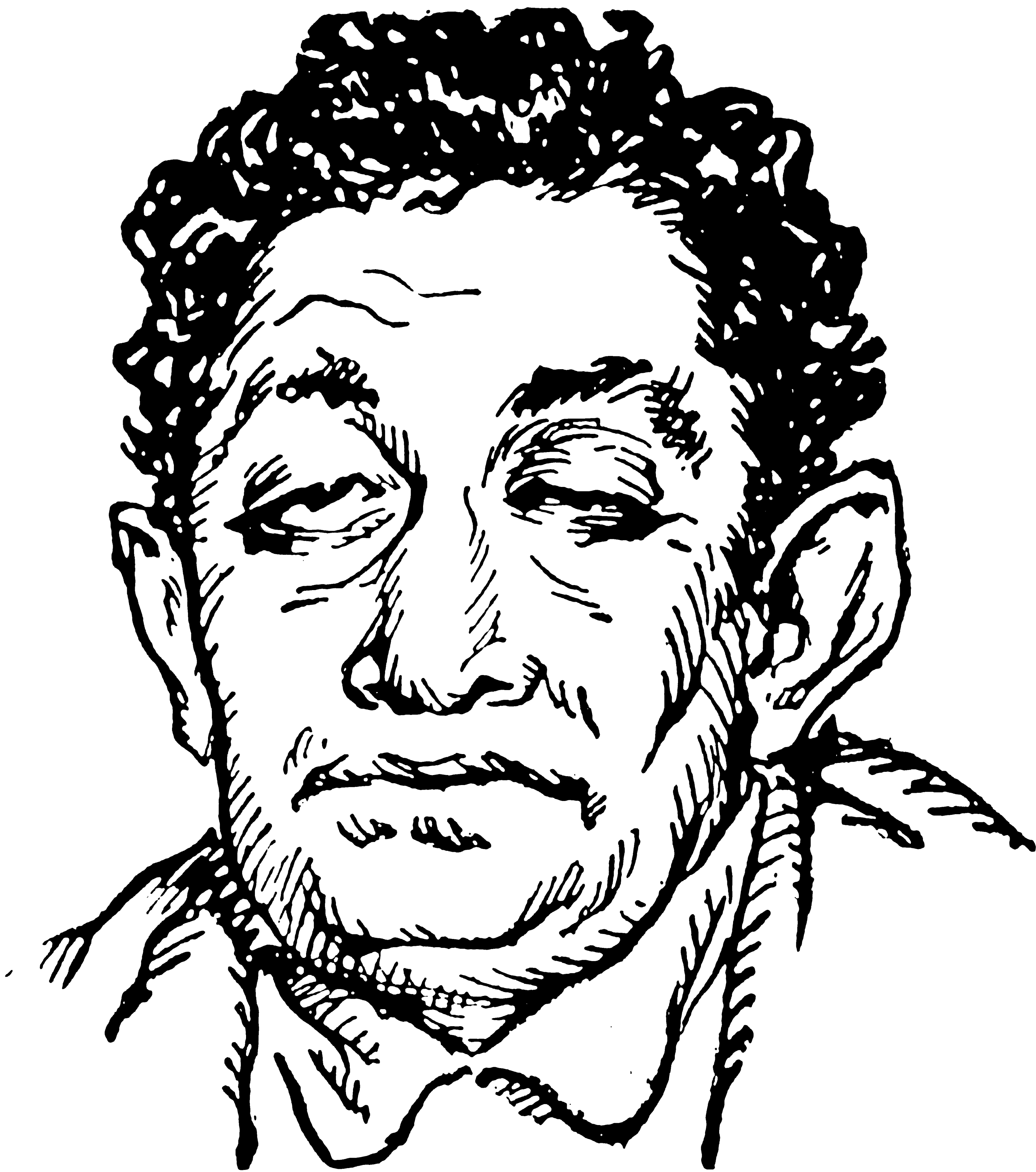
Sinowjeff-Appelbaum (Apple tree)

Soviet Governor of Petrograd, President of the Soviet Commonwealth of the North; President of the Executive of the third International.