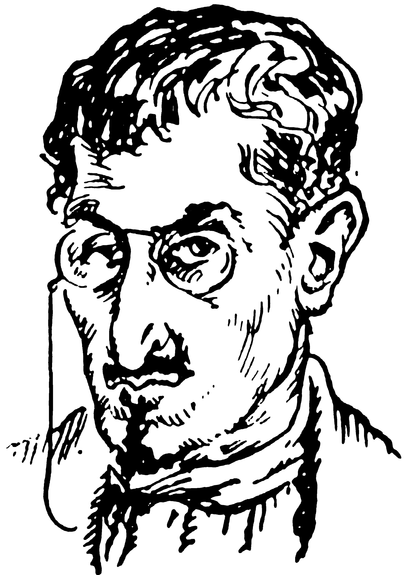
Proschian-? his pseude-German alias not known. Minister of Agriculture.

The law seems always fickle, But the Jew cuts its top with a sickle, Tears it out by the root Till his ends it will suit. If thus at his bidding the Law does fall, What if 'Justice' be at his beck and call?